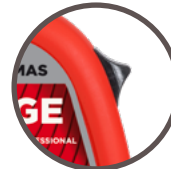
easily accessible tape lock