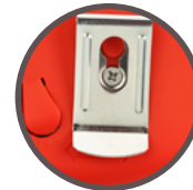
steel belt clip