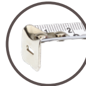
multi-functional blade hook