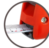
safety buffer (5M version only)