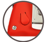
one touch blade brake