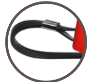
ABS wrist strap